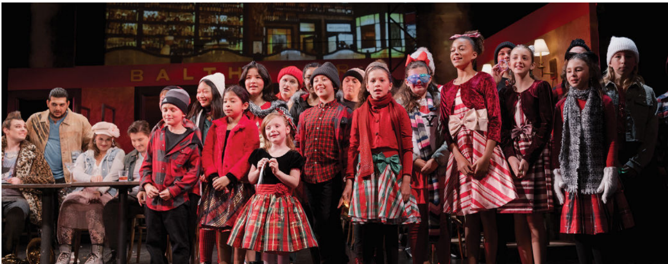
SING! choristers performing in this summer's production of La bohème